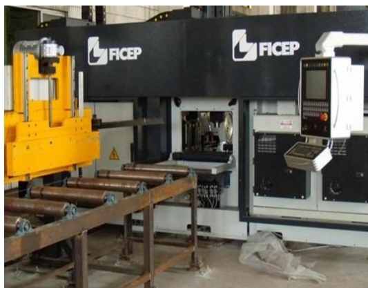
“FICEP” Angle Drilling CNC Machine

Insisting on the development strategy or professional and dedication with steady accumulation, after constant development, currently, “He Fa” company occupies an area of nearly 80000 square meters, with more than 300 sets of production equipments. It has equipped 15 angle steel and plate automatic production line, and has introduced Italy “FICEP” CNC angle steel production line, CNC plate high speed drilling line. In addition, the company has equipped 24m steel plate CNC cutting line, pipe line automatic arc welding machines. Company has 7000 square meters of trial- assembly site, and 2 galvanizing product lines applying effective and environment protective electric heating technology and automatic monitoring technology, as well as environment protective dust collection equipment imported from Germany, and recyclable zero discharge waste water treatment stations.