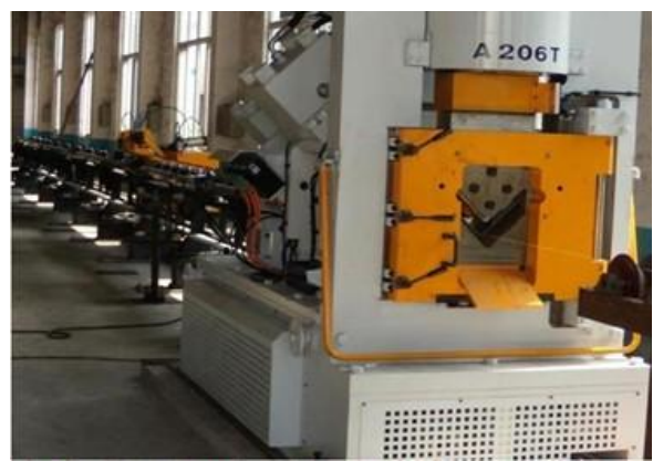
“FICEP” Angle Punching CNC Machine