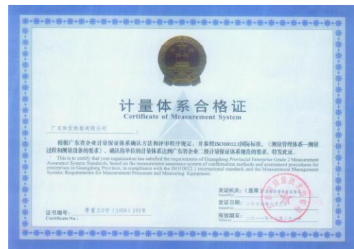
Grade II Measurement Qualification Certificate