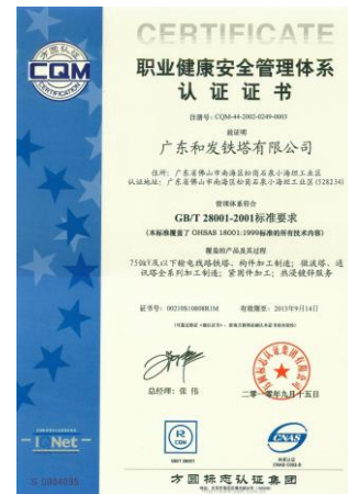
quality management system, environment management system and vocational healthy safety management certification

Rooting at the domestic market, guiding by the international market, “He Fa” boasts top quality and elaborate service with the output capacity increasing steadily and the products are sold well all round China with high confidence from users. Additionally, the products are also exported to such countries and regions as South Korea, Malaysia, Philippines, West Africa, South Africa,