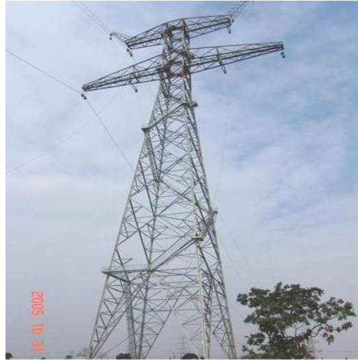
全塔高 120 米 SKT721B 西江大跨越

Currently, the main products of the company are: 750kV and lower transmission line angle steel and steel tuber towers, cross-arm of concrete pole, transformer substation structure, steel structure, microwave and telecom steel towers, non standard metal tools, hot-dip galvanizing bolts, vacuum sheradizing bolts, and with the business covering hot-dip galvanizing and vacuum sheradizing steel structure.