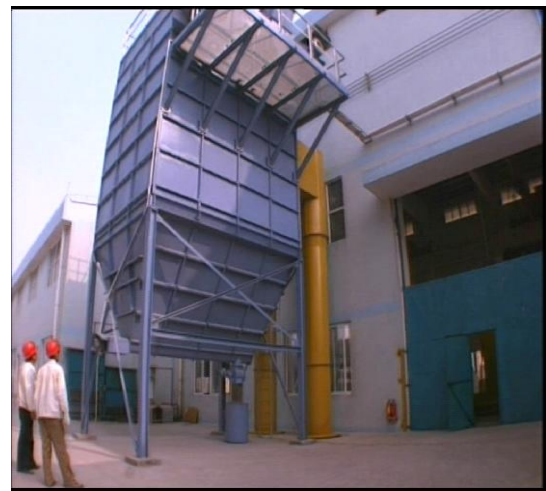
automatic smoke and dust collector

Our annual output capacity in steel towers and steel structures reaches 100000 tons, and hot-dip galvanizing reaches 200000 tons, and the company has established the symbolic status in the industry.